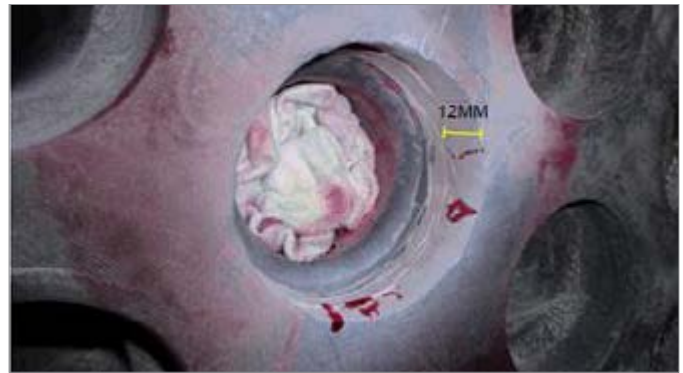
Qatar Waste Heat Boiler Crack after Welding