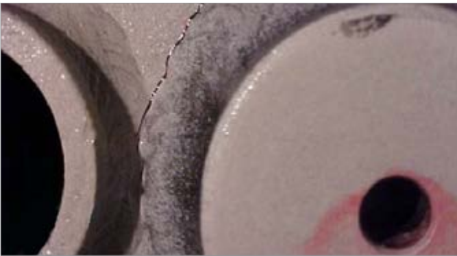
SKW Piesteritz Waste Heat Boiler Crack after Welding

The same tube plugging effectiveness occurred at a Fertilizer Manufacturer (Ammonia) in Mesaieed, Qatar. After a short time welding plugs, the customer noticed cracking around the heat affected zone. EST Group engineered and manufactured a special Pop-A-Plug Tube Plug allowing the customer to safely and efficiently install it into the tubesheet. Subsequently, there were no more issues with heat affected zones – no further tube and weld damage has occurred.