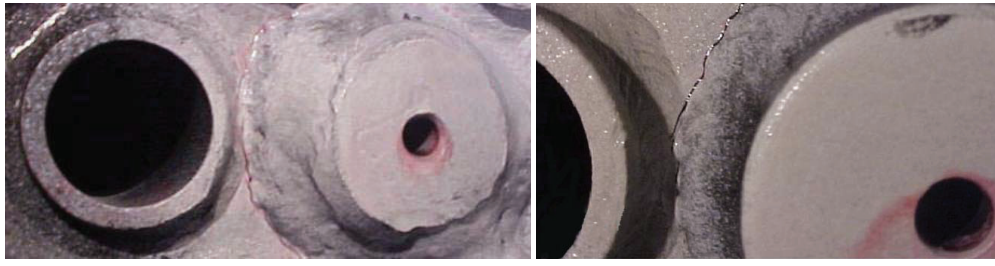
Figure 3. Circumferential cracks after the units have gone back into service and were exposed to extreme temperature cycles.