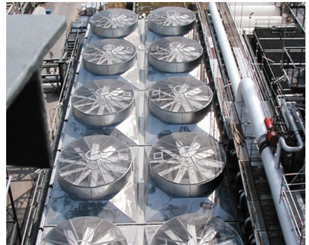
Pop-A-Plugs are the ideal tube plugging solution for Air Cooled Heat Exchangers.

EST Group's proven Pop-A-Plug® heat exchanger tube plugging system has been further developed for the Air Cooled Heat Exchanger (ACHE) or Fin-Fan market. ACHE units required "extended" tools as pneumatic tube testing and mechanical tube plugging needs to be done "at depth" through the narrow entry of the plug sheet in the deeper tube sheet. EST Group has a revolutionary new approach to supply the Pop-A-Plug Kits ( 1 Kit = 10 Plugs) and accessories to perform the actual tube testing and plugging as a standard package which allows the technicians to test and plug tubes very quickly without any need for hammering or welding. Unlike hammered in (welded) tapered plugs which are troublesome to weld and require weld permits the tube testing and plugging become a simple and controlled operation. Once Pop-A-Plugs are installed they will remain leak tight throughout your heat exchanger's life cycle. In service for 20 years, the Pop-A-Plug P2 (High Pressures up to 7000 PsiG (483 BarG) and Pop-A-Plug CPI/PERMA (Medium Pressures up to 1000 PsiG ( 69 BarG) are a proven long-term performer in Air Cooled Heat Exchangers operating at pressures up to 7000 PsiG (483 BarG).