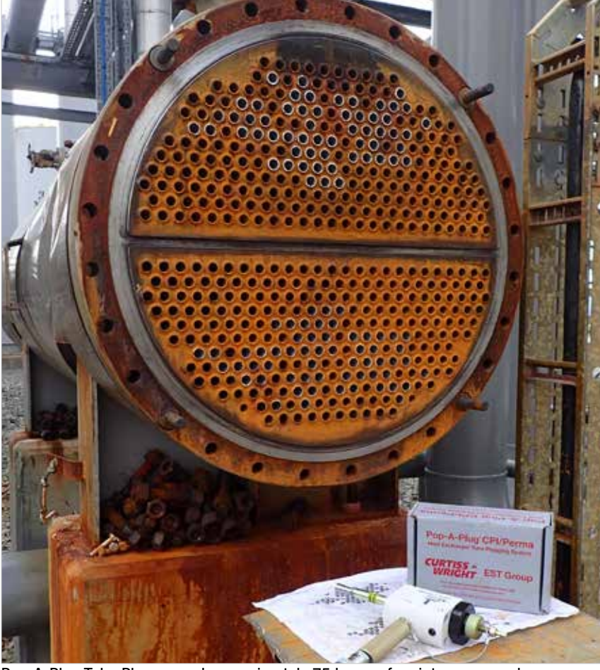
Pop-A-Plug Tube Plugs saved approximately 75 hours of maintenance work

Curtiss-Wright EST Group's regional distributor, Jergo Group, proposed Pop-A-Plug Tube Plugs as an alternative. The weld-free plugging system provided a helium leak-tight seal to 1 x 10^{-10} cc/sec. The refiner preferred the Pop-A-Plug's "cold" installation method, which made it easier to work with than welding plugs and safer in explosion risk zones.