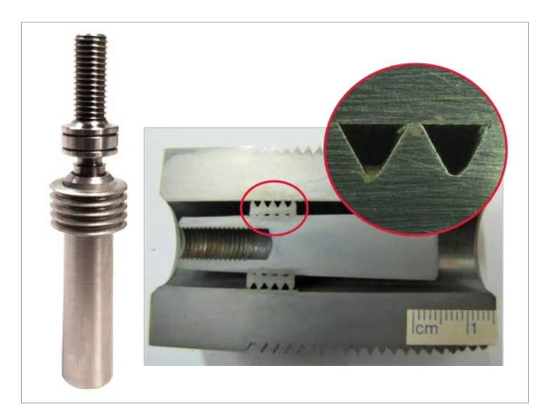
Pop-A-Plug Tube Plug and sectioned serration detail

A simple hydraulic installation provides a safe method for sealing heat exchanger tubes with superior stability. Each plug is installed using a hydraulic ram using the onsite air supply. As the ram pulls the tapered pin through the ring, it expands into the tube to create a helium leak-tight seal to 1 x 10<sup>-10</sup> cc/sec. When the proper force is reached, the breakaway pops.