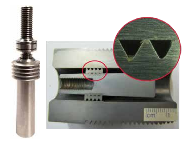
Pop-A-Plug Tube Plug and sectioned serration detail

A simple hydraulic installation provides a safe method for sealing heat exchanger tubes with superior stability. Each plug is installed using a hydraulic ram using the onsite air supply. As the ram pulls the tapered pin through the ring, it expands into the tube to create a helium leak-tight seal to 1 \times 10^{-10} cc/sec. When the proper force is reached, the breakaway pops.